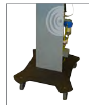
Mobile wheeled base.