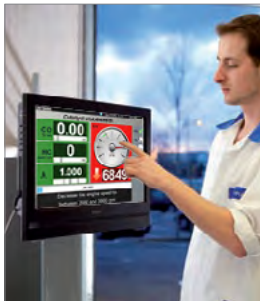
22" touch screen technology.