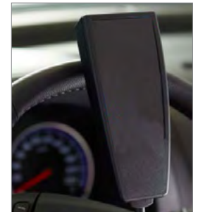
Bluetooth RPM & temp probes.