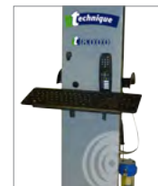
Wireless keyboard with shelf.