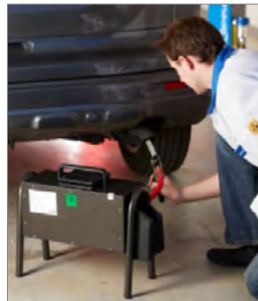
Bluetooth smoke meter.