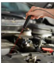
Infra-red temperature probe.