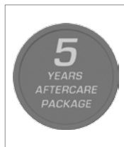
5 year aftercare package.