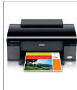
A4 colour printer.