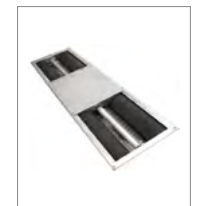
Class 1,2,4,5L,7 roller brake tester options.