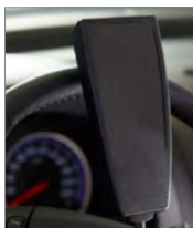
Bluetooth EOBD interface tool.