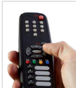
Infa-red remote control.