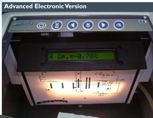
Advanced Electronic Version